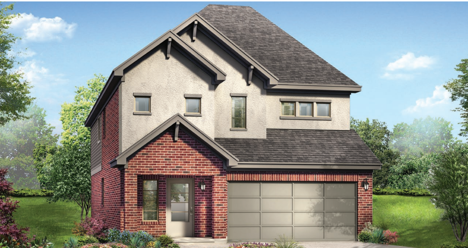
STYLE E - 1600 SQ.FT.