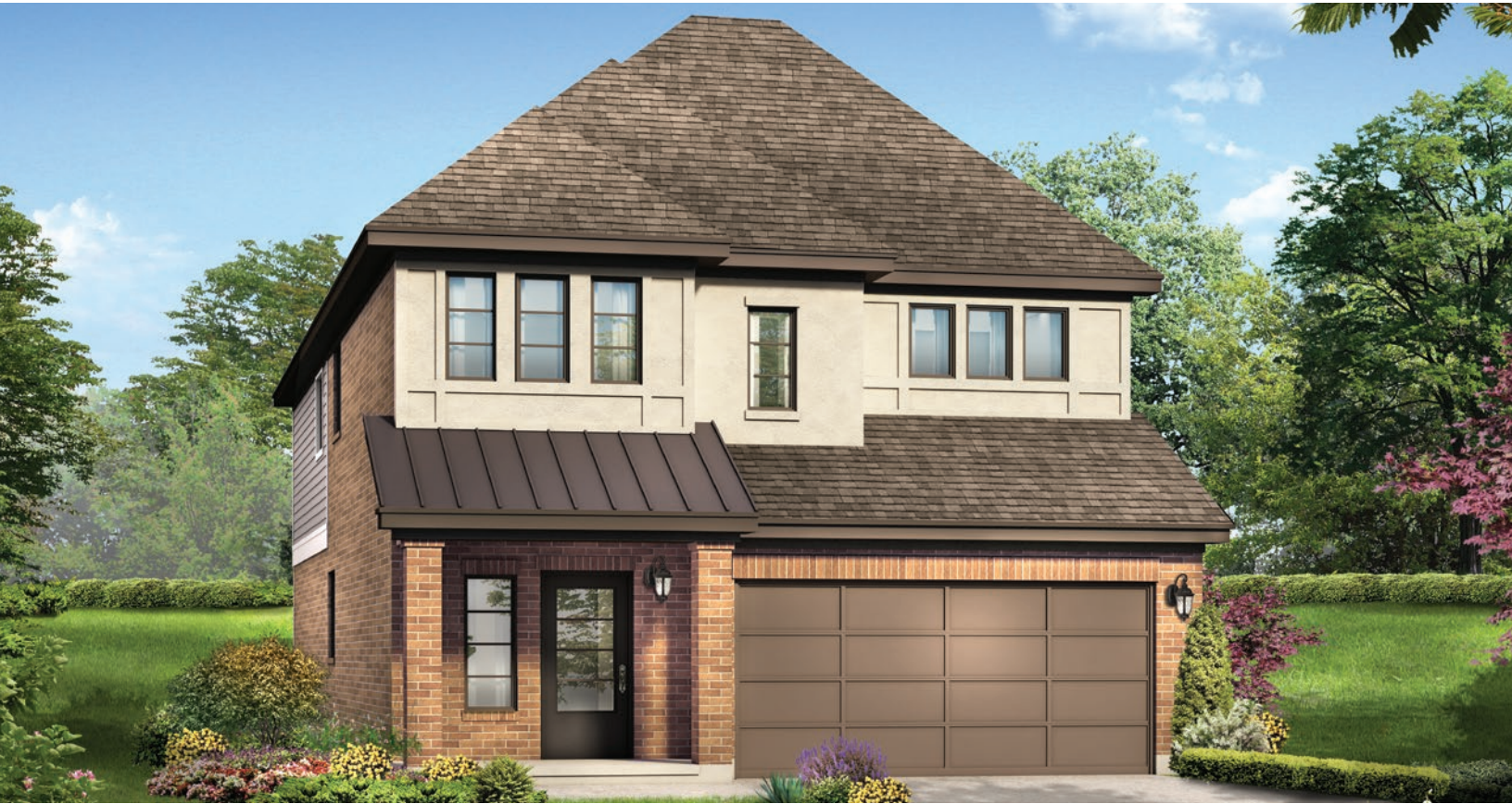
STYLE D - 1600 SQ.FT.