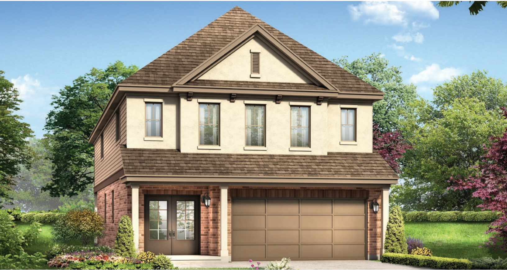
STYLE D - 2028 SQ.FT.