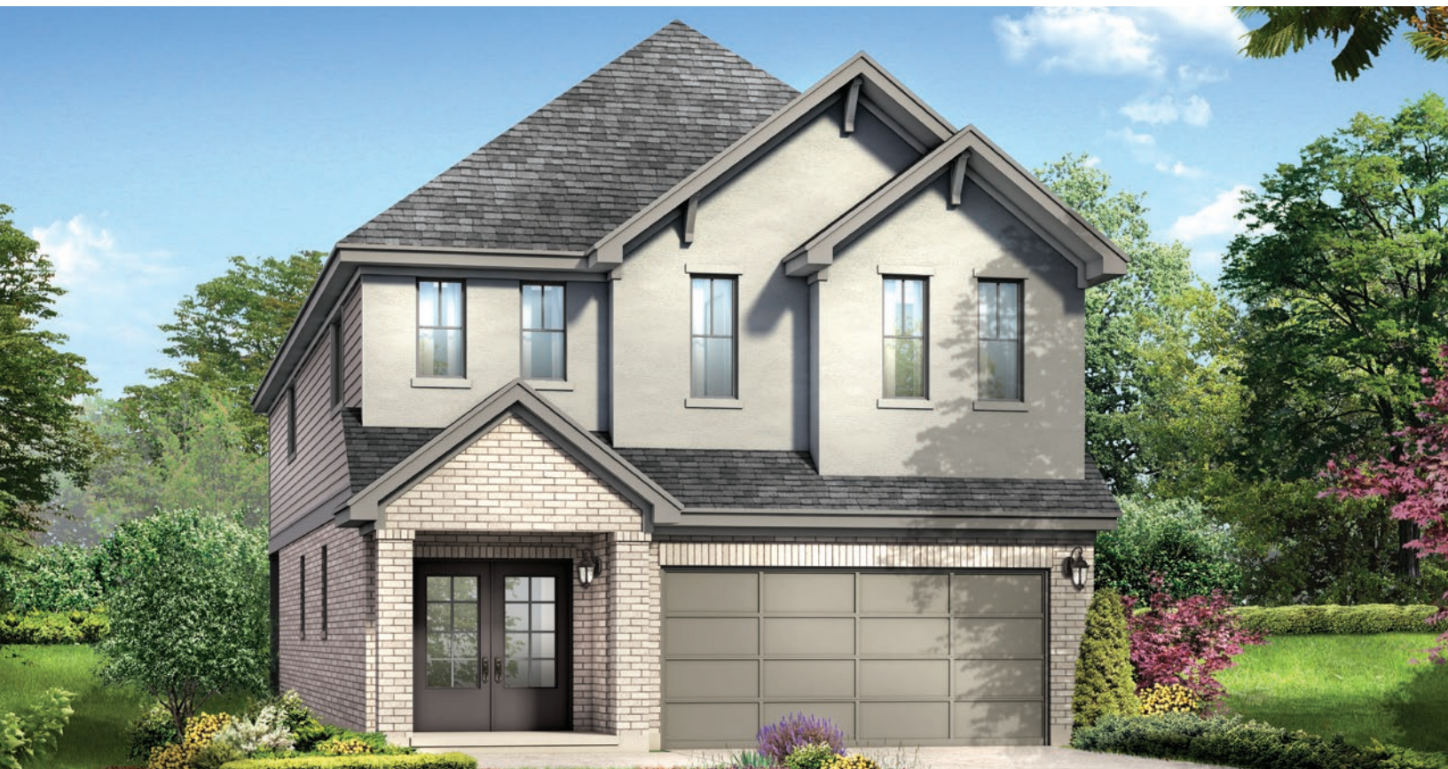
STYLE E - 2028 SQ.FT.